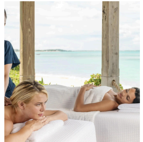
WELLNESS & SPA